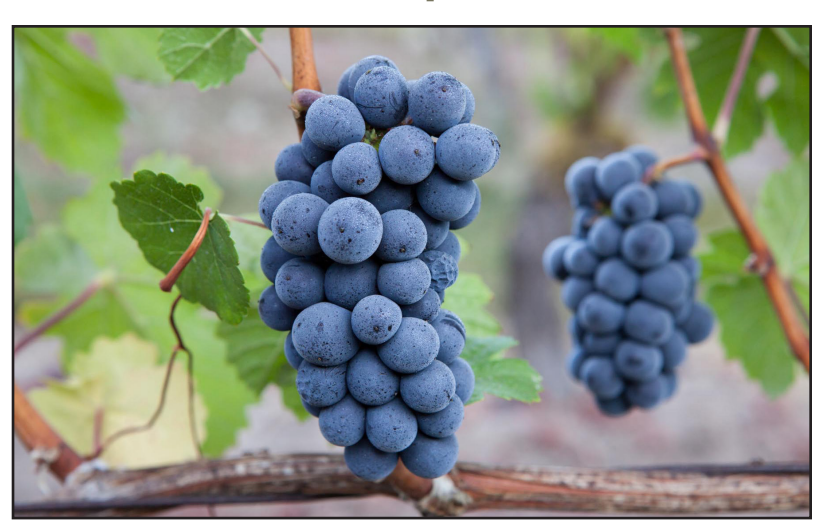
Pinot Noir grapes at Elk Cove

pH: 3.58 TA: 4.95 Alc: 14% v/v Bottled July 2018 Cases Produced: 205