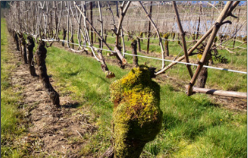
Old Vine Pinot Noir vine showing off its mossy top after the first cuts of the pruning season.