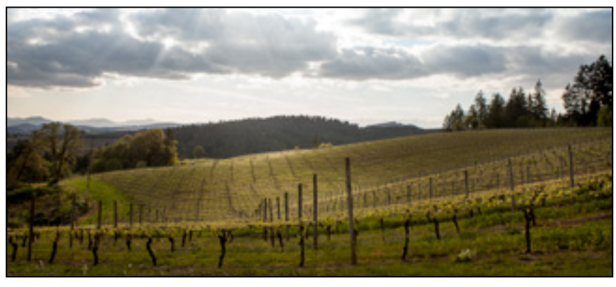
La Bohème Vineyard, Spring 2015