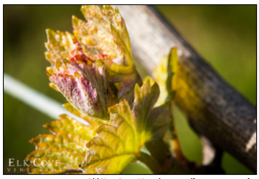
Old Vine Pinot Noir showing off its mossy top after the first cuts of the pruning season.