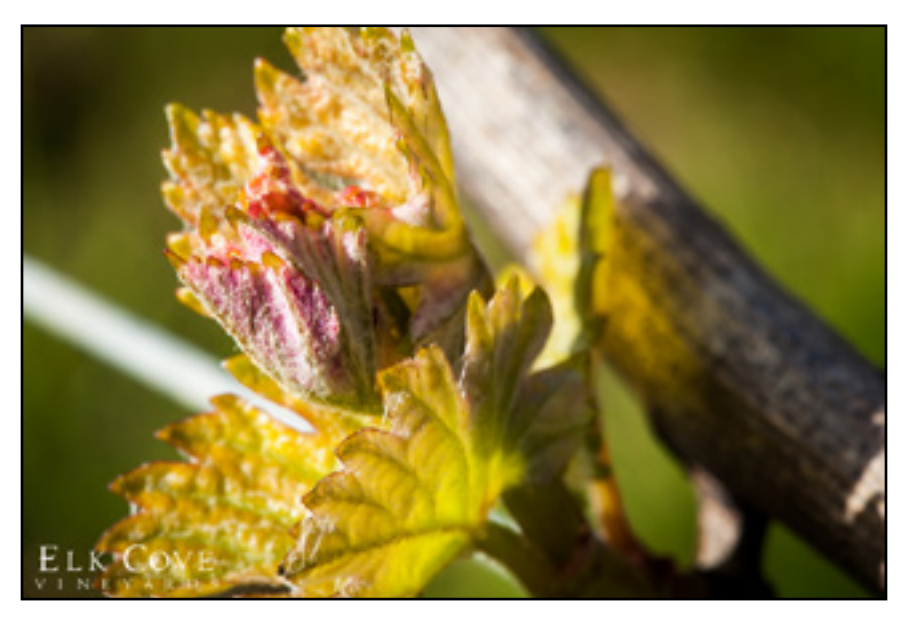
Pinot Noir vine at budbreak