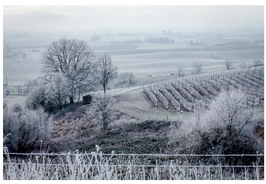
Mount Richmond West Block during a winter freeze