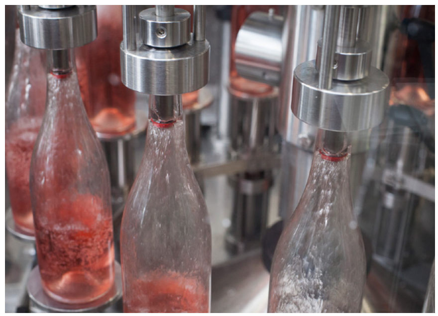
Bottling our Rosé