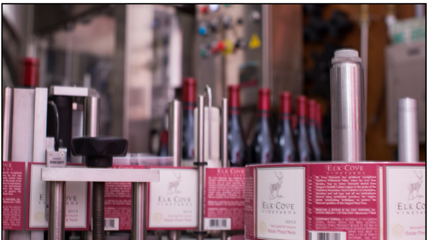
2015 Willamette Valley Pinot Noir on the bottling line