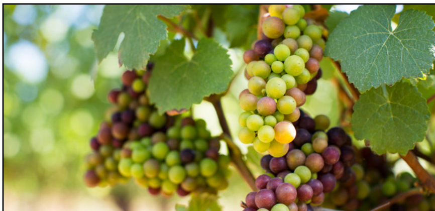
Veraison in our Roosevelt Block