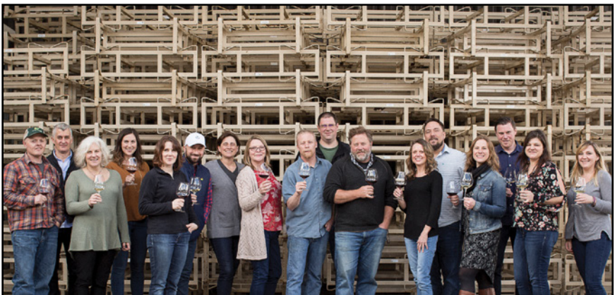
The Elk Cove Crew