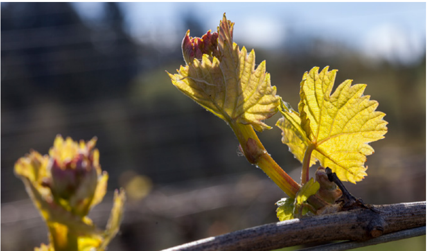
Budbreak is the beginning of our growing season