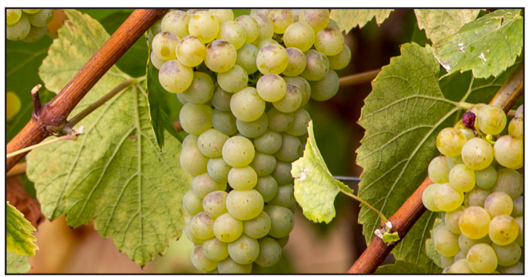
Chardonnay grapes at Elk Cove

pH: 3.28 TA: 5.7 Alc: 12.5% v/v Bottled March 2018 Cases Produced: 376