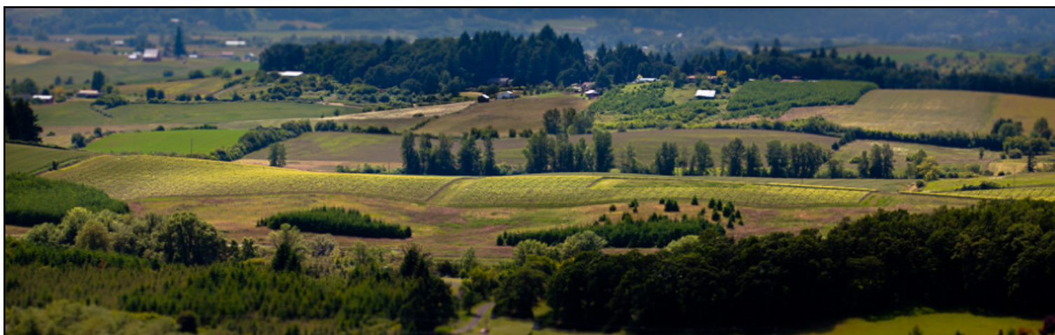
Goodrich Road Vineyard in late spring.